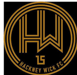
Hackney Wick FC